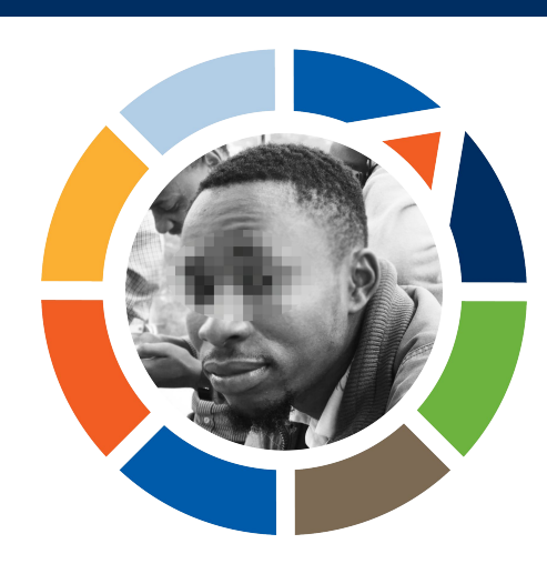
"Trusting someone and that person being truthful are two different things."